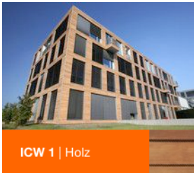
ICW 1 | Holz