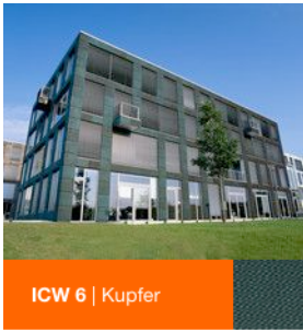
ICW 6 | Kupfer